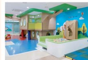
Fun Unification (Play Experience)