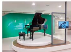
Piano of Unification (Sing In Uniry With The Symbol Of Division)