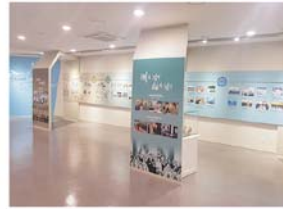
History of Inter-Korean Relations