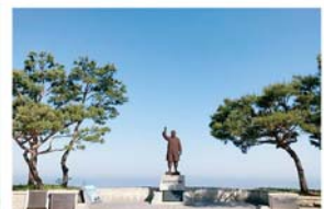
Statue of Nationalist Man-sik Jo