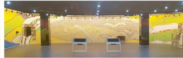
'My Hometown': Installation piece constructed with the pictures of separated families