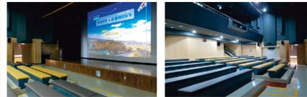
Theater (200 Seats): Video presentation of current status of North Korea and cultural performance