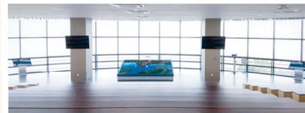
Observation Room (300 Seats): Describes topography in video