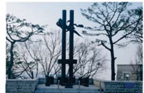
Stele in Aspiration for Unification