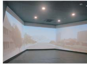
Video Room (Searching for Memory)