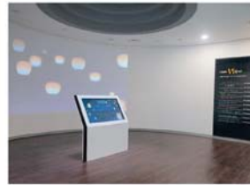
Aspiration Hall (Electronic Guestbook)