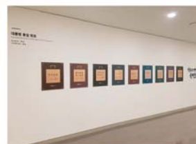
Exhibition of Unification Calligraphy by Former Presidents