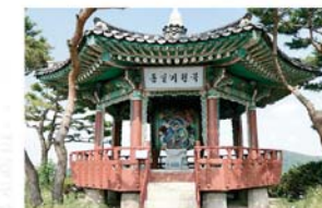
Drum House Constructed in Aspiration for Unification