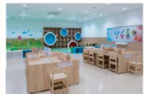
A Road for Unification (Puzzle)