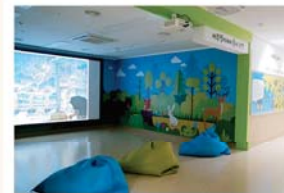
DMZ Video Room