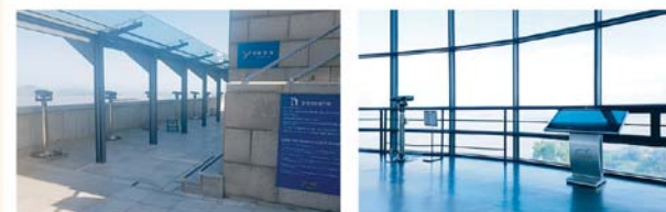
Outdoor Observation Deck