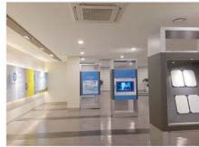
Moon Jae-in's Policy on the Korean Peninsula