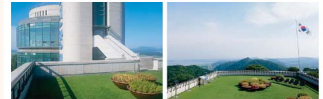
Bridge to Outdoor Observation Deck